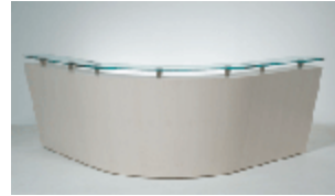
Arnold Reception Desks

The Arnold Companies represents six independent contract furniture manufacturers that have been serving the design and corporate community since 1962. The Arnold companies offer a highly versatile line of quality products. (Please click on any picture or name.)