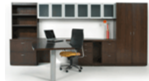
Arnold Kolax Furniture

The Arnold Companies represents six independent contract furniture manufacturers that have been serving the design and corporate community since 1962. The Arnold companies offer a highly versatile line of quality products. (Please click on any picture or name.)